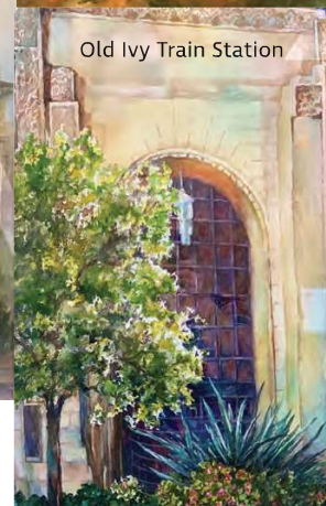
Old Ivy Train Station