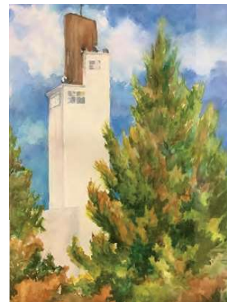
Tower at Veterans Park

If we can be of help for a review of your current coverage or assist with an